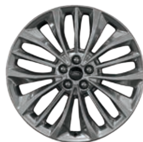
20" Polished Aluminum Included with Titanium Elite Package