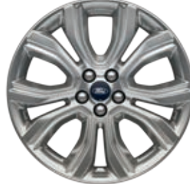
19" Luster Nickel-Painted Aluminum Standard on Titanium