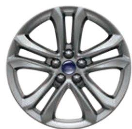
18" Split-Spoke Sparkle Silver-Painted Aluminum Standard on SEL Optional on SE