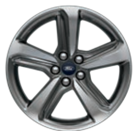
18" Bright-Machined Aluminum with Premium Dark Stainless-Painted Pockets Optional on SEL