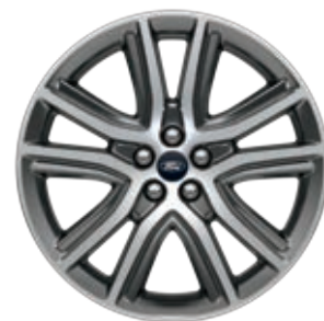
20" Bright-Machined Aluminum with Premium Dark Stainless-Painted Pockets Optional on Titanium