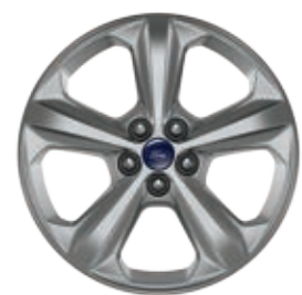
18" Sparkle Silver-Painted Aluminum Standard on SE