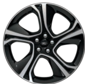
20" Bright-Machined Aluminum with High-Gloss Black-Painted Pockets Standard on ST