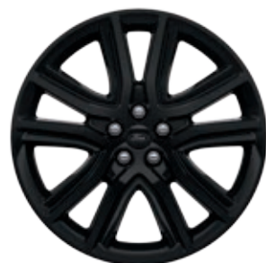
20" Premium Gloss Black-Painted Aluminum Standard on ST-Line