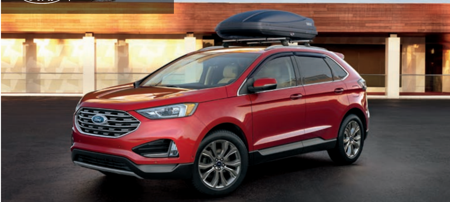
Titanium in Rapid Red Metallic Tinted Clearcoat 1 accessorized with smoked side window deflectors, 2 front and rear molded splash guards, roof-mounted crossbars, 3 cargo box, 2,3 and wheel lock kit