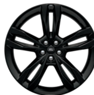
21" Premium Gloss Black-Painted Aluminum Optional; Included with ST Performance Brake Package