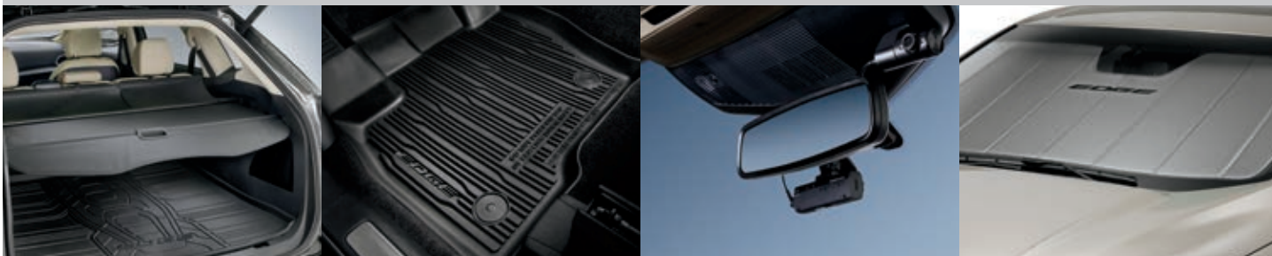
Cargo area protector and cargo cover